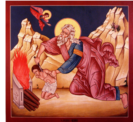
THE SACRIFICE OF ISAAC

Twenty Fifth Annual Conference sponsored by the Orthodox Christian Women of Montreal